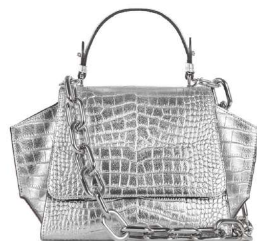
Gemma Mini gold - 205110C113 Gemma Mini fucsia - 205110C118 Gemma Mini silver - 205110C119