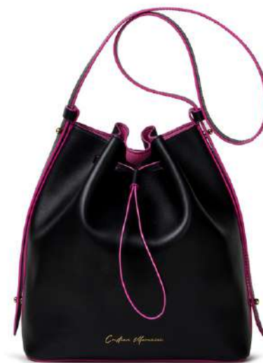
Sandra black/pink - 210110L233