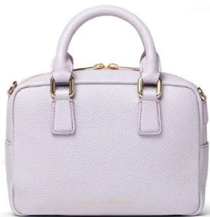
Ester mauve - 240110G123