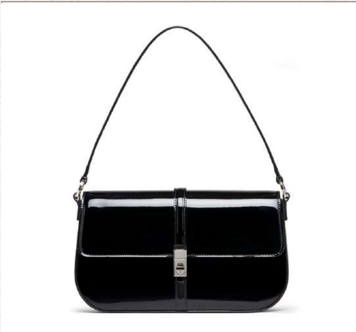
Emma flap black - 231110V100