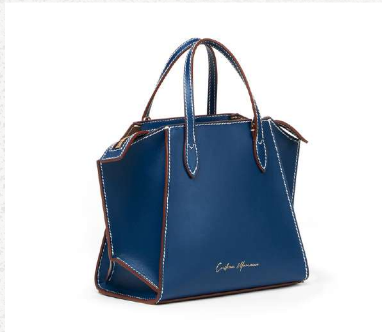
Gemma S navy - 202110L120