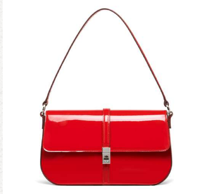
Emma flap red - 231110V101