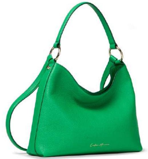
Luna green - 250110G102