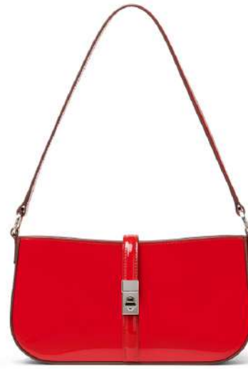
Emma red - 230110V101