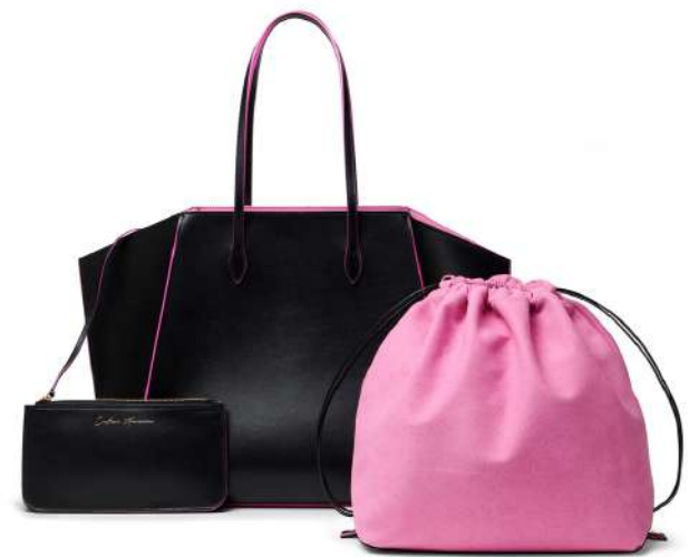
Gemma L black/pink - 200110L233