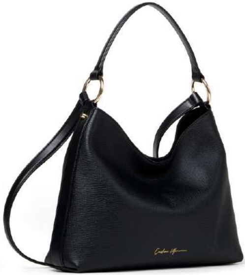
Luna black - 250110G100