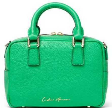
Ester green - 240110G102