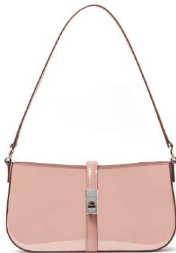
Emma powder pink- 230110V124