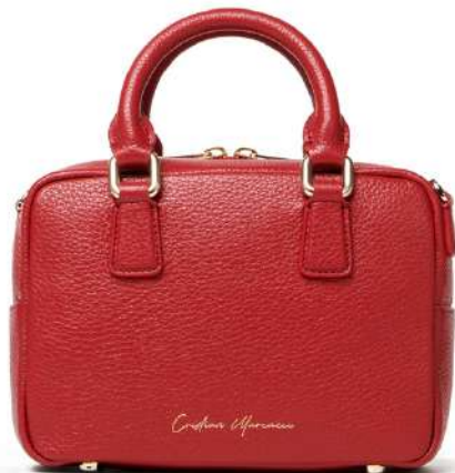
Ester red - 240110G101