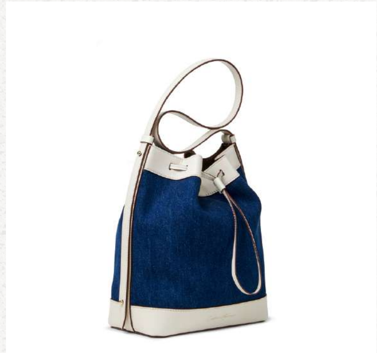
Sandra Denim/cream - 21022DL231