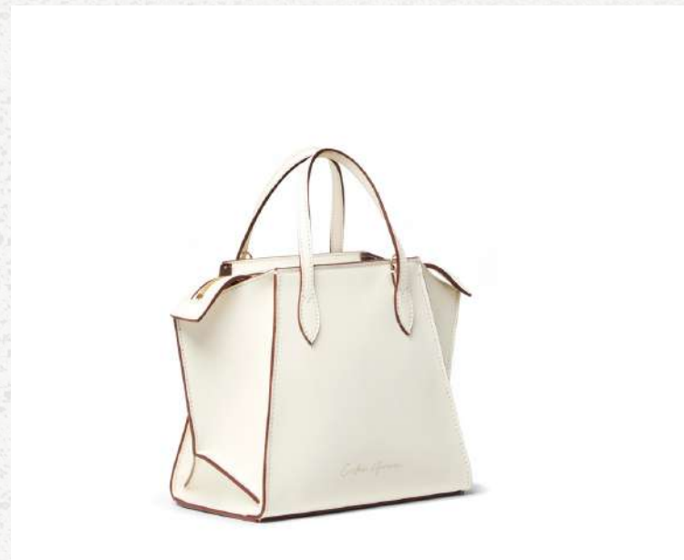
Gemma S cream - 202110L121