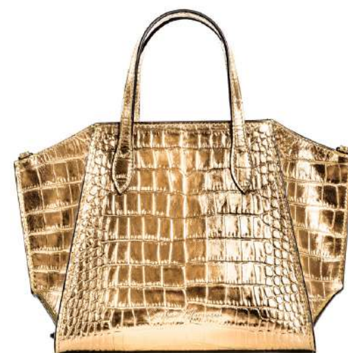
Gemma S silver - 202110C119 Gemma S fucsia - 202110C118 Gemma S gold - 202110C113