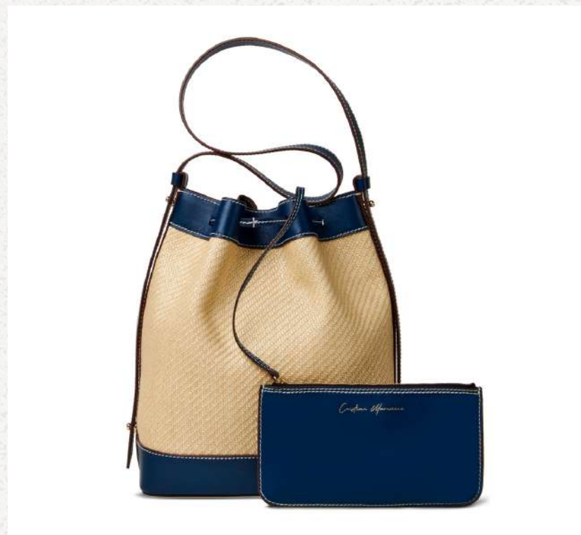
Sandra navy/raffia - 21022RL232