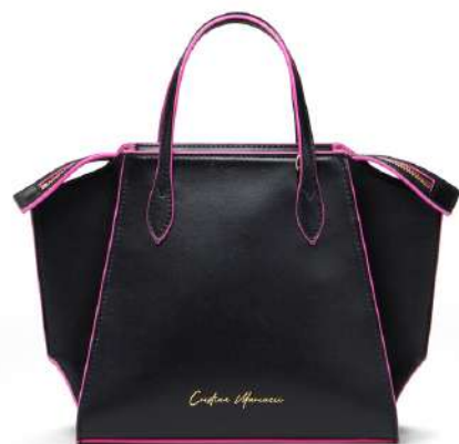
Gemma S black/pink - 202110L233