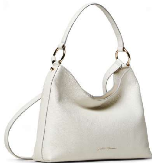
Luna mauve - 250110G109