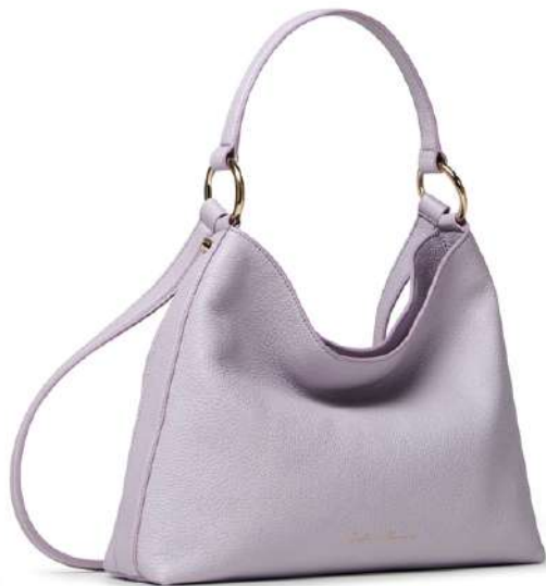
Luna mauve - 250110G123