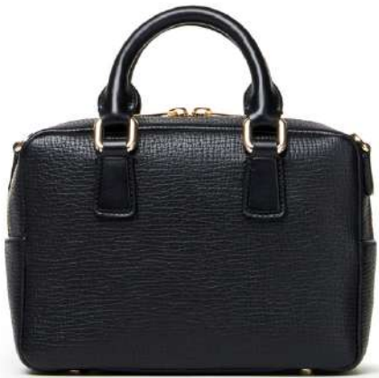
Ester black - 240110G100