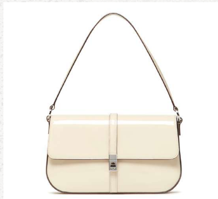
Emma flap ivory - 231110V125