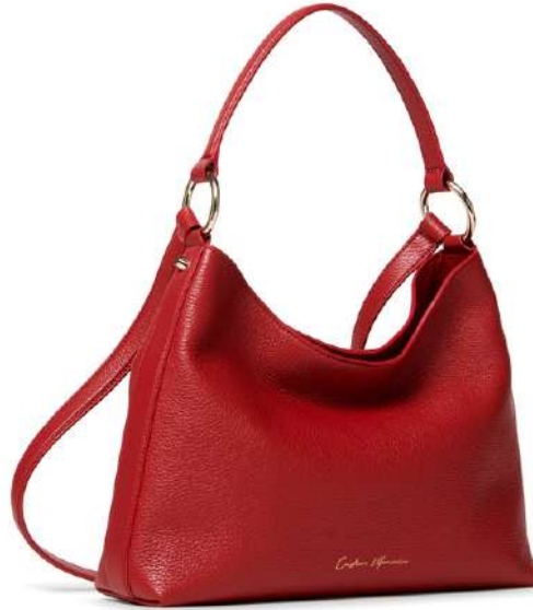
Luna red - 250110G101