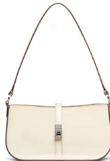
Emma ivory - 230110V125