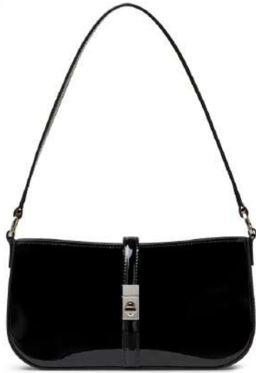
Emma black - 230110V100