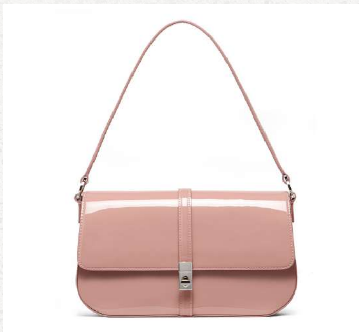
Emma flap powder pink - 231110V124