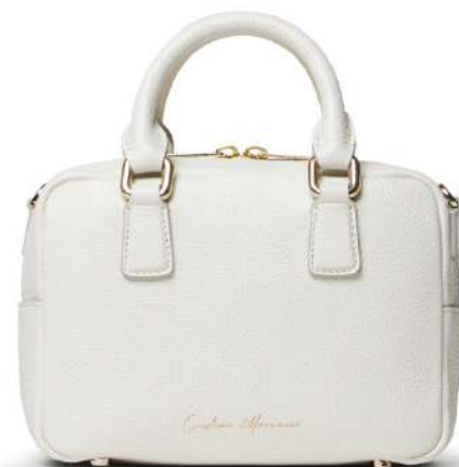
Ester white - 240110G109